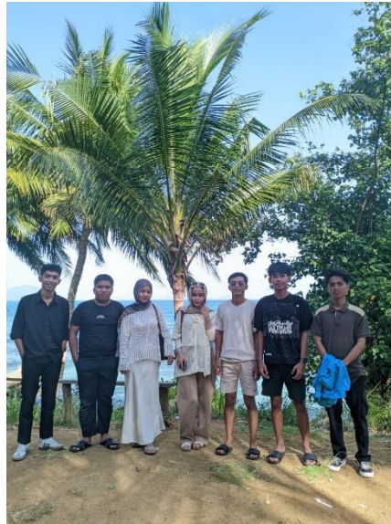
Figure 3 Field Interview Documentation

the economic activities of the local community through the development of community-based tourism.