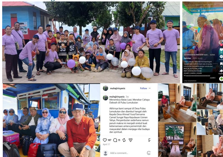
Figure 1 Digital Da'wah Communication Actor Post