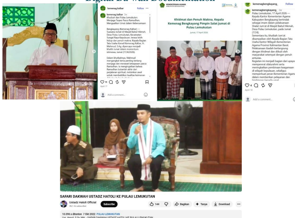
Figure 2 Digital Da'wah Documentation